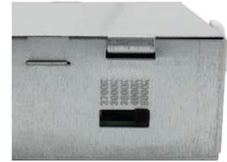
5-level CCT switch