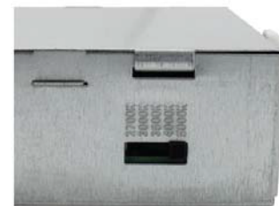
5-level CCT switch